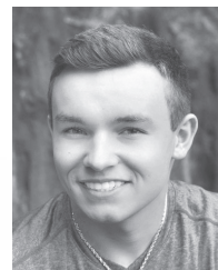
Kohl Hughes James Krabill Memorial Scholarship The Ohio State University College of Veterinary, Veterinary Medicine