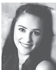
Nicole Montgomery Teutsch Memorial Scholarship Bowling Green State University, Marine Biology