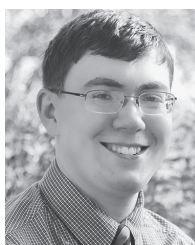
Jackson Molody Battershell Family Scholarship / Gordon A. Eaton Scholarship / James Krabill Memorial Scholarship Ohio State University Agricultural Technical Institute, Horticultural Sciences