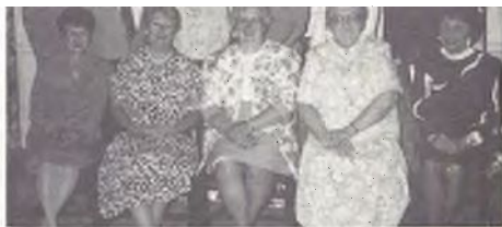
Members of the Class of 1946 enjoyed attending the MAA reunion and renewing old acquaintances.

Ten members from the class of 1946 in attendance were honored for celebrating their 50th anniversary of graduation, and class members from 1971 were recognized for their 25th year anniversary. All of the honorees received a souvenir honoring the occasion.