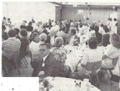
Over 100 M.H.S. Alumni and friends enjoy a great evening of good food, entertainment and renewal of friendships.